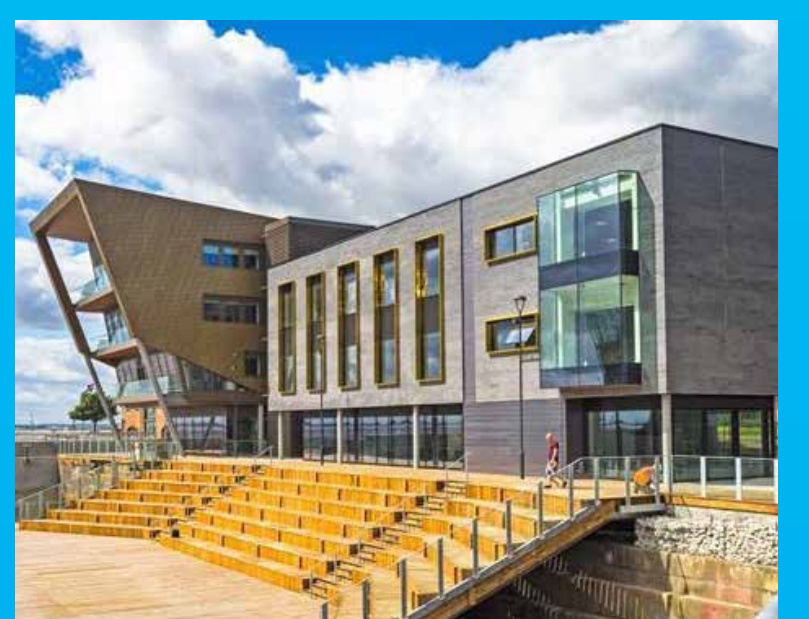
Warrington Council, One Stop Shop